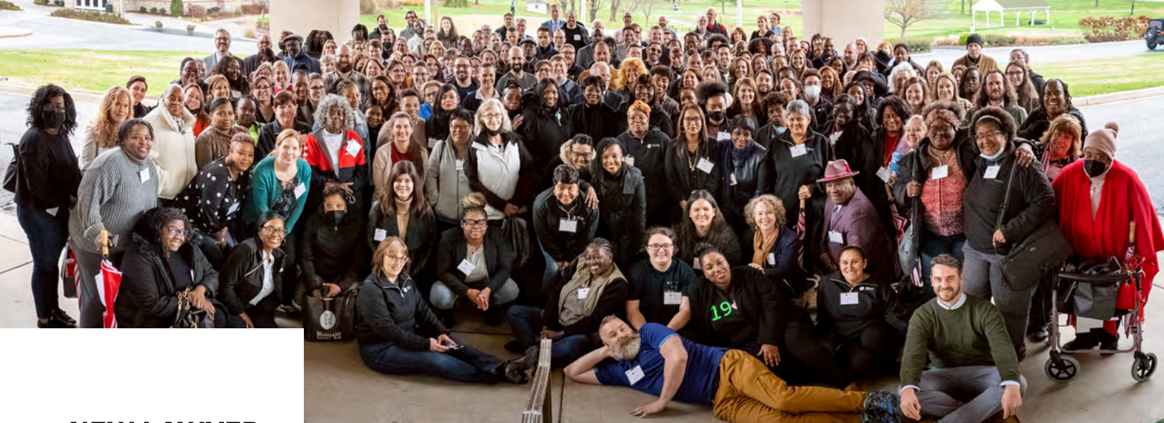
MLA and MCLA staff at the 2022 All-Staff & Board Conference